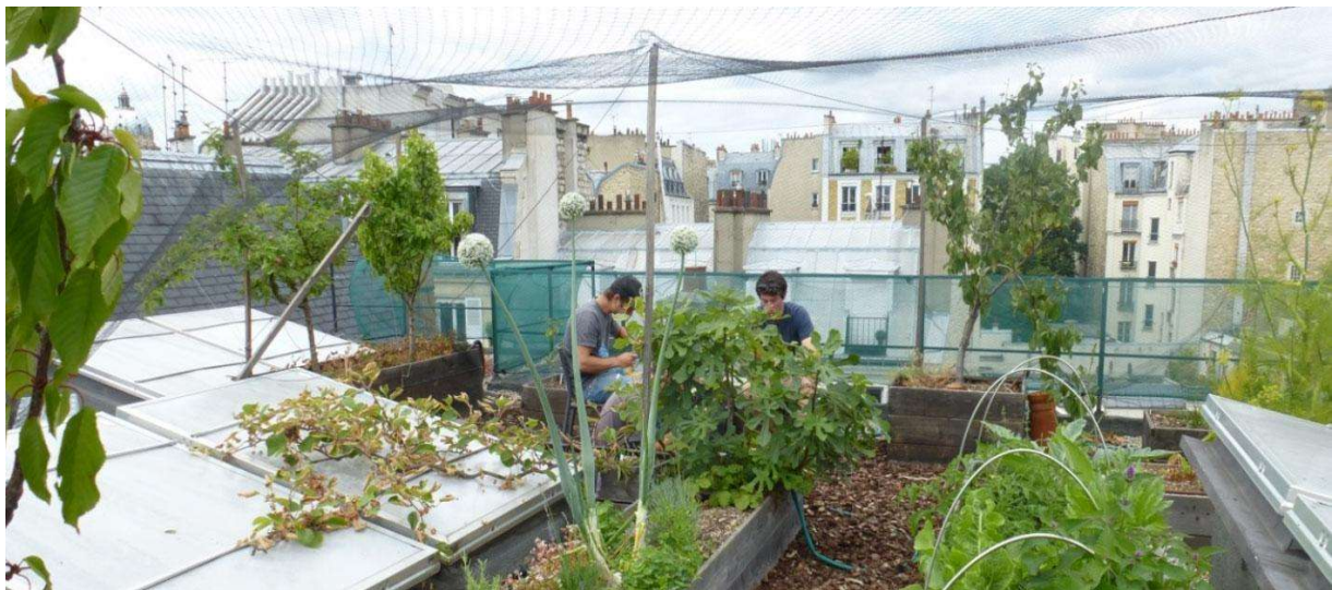
Rooftop garden on the roof of AgroParisTech in Paris, France.