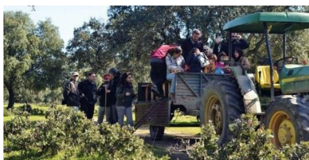
CSA field visit, Cáceres, Spain.

Incubation programmes can be a quick way to learn the best practices needed to start a CRFS project. These programmes often provide training in an informal setting over several weeks or a growing season. They are usually structured as a series of "crash courses" where participants learn best practices in a short period of time on topics such as business model, marketing and sales, farm planning or best practices for season extension. A course like this, as for example offered by Nabolagshager in Oslo, Norway, can be an excellent opportunity for aspiring farmers to network with each other and share experiences and problems.