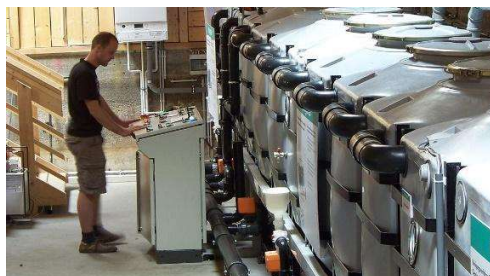
Greywater treatment plant at Water House , Berlin, Germany.

A locally integrated food economy - from farm to table to waste disposal and recycling - reduces transport costs, so that a resource cycle can be the more economical option. The food system can be interwoven with the urban fabric and other social and economic activities in the city by bringing together actors of different parts of the system and improving synergies more easily. This also includes a closer relationship between consumers and producers, creating a basis for greater awareness, respect and solidarity, leading to more sustainable consumption choices and/or active engagement as prosumers.