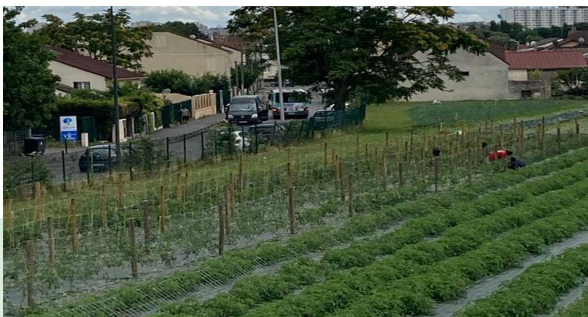
Fermes de Gally, Saint Denis, France.