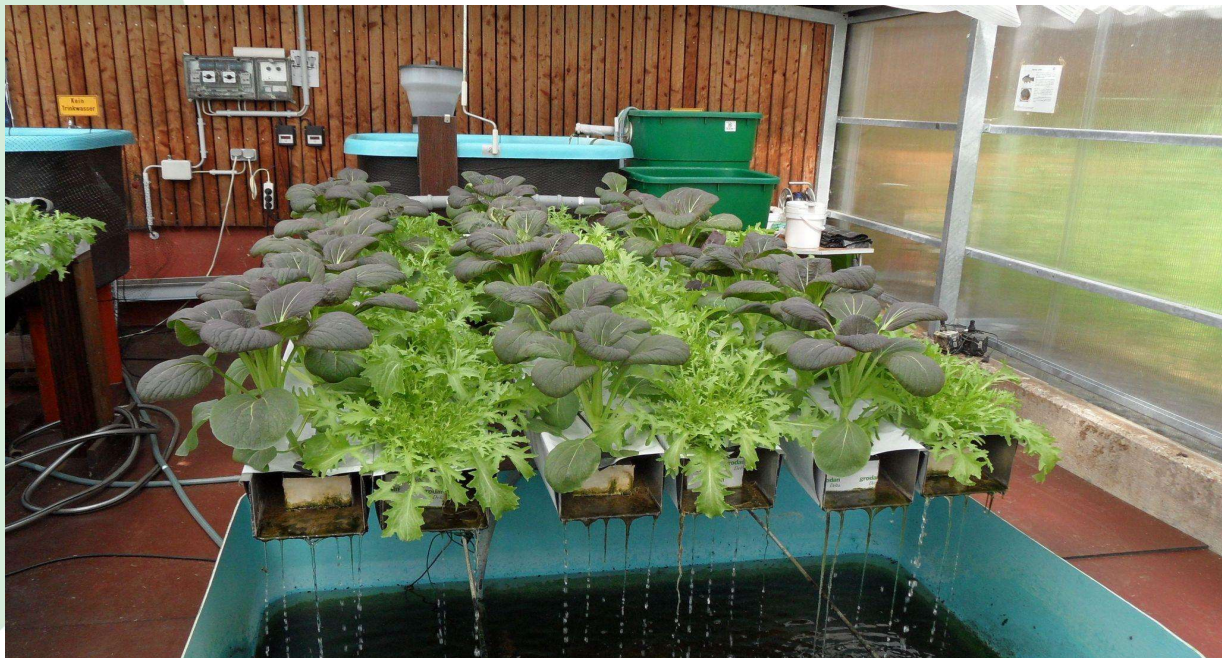
Roof Water-Farm hydroponic greenhouse, Berlin, Germany.