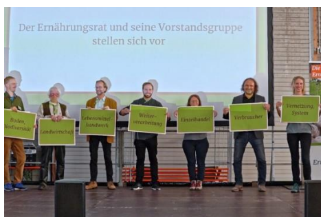
Executive committee of the FPC for Upper Franconia, Germany, representing all parts of the food chain.

A recent analysis by the European Commission showed how agricultural and climate policies are siloed and therefore incoherent. They found that Voluntary Coupled Support (VCS) is provided to support the production of fruits and vegetables, cotton and rice in Andalusia, whose production drives overexploitation of water resources. Furthermore, direct payments are given for agricultural activities on peatland/ wetland, with no conditions for limiting damage (which results in high levels of GHG emissions). And measures for forest investment are potentially incoherent with market stability and food security as afforestation potentially converts land from agricultural uses into forests.