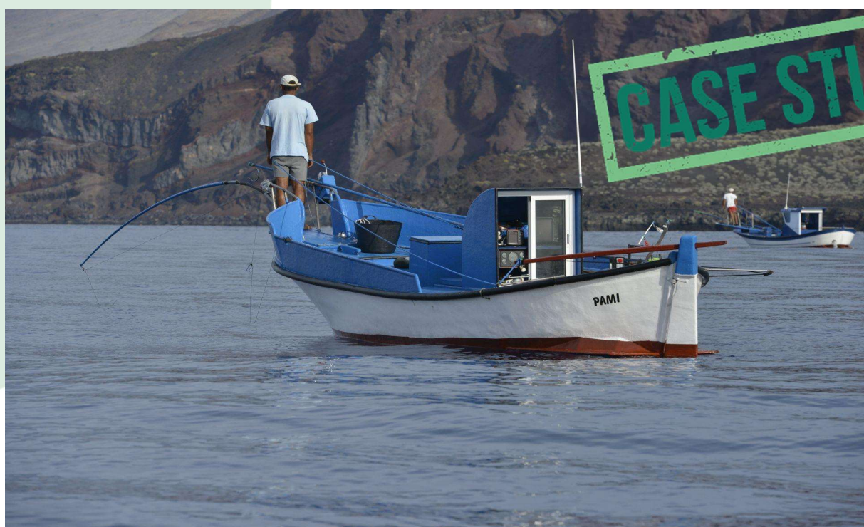
La Restinga, El Hierro, Spain.